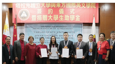
TSU, LGU Tarlac City inks partnership with Chinese Training School