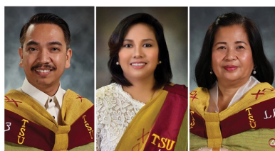
New officials appointed under OVPPQA