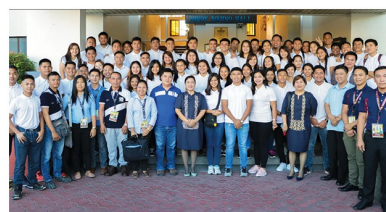
TSU secures top 2 performing school in December CLE