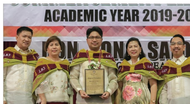
TSU sends off 500 graduating students for the 31st Commencement Exercises