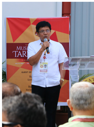
From page 1